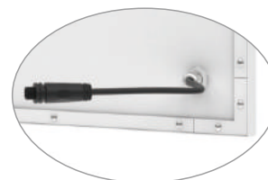
IP65 waterproof connector and gland nut